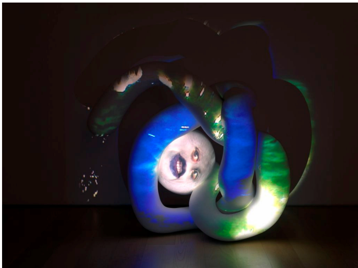
Million Miles (Orbital Screw), 2007 fiberglass, video projection / H 122 x 168 x 76 cm - H 48 x 66 1/6 x 30 inches / Unique