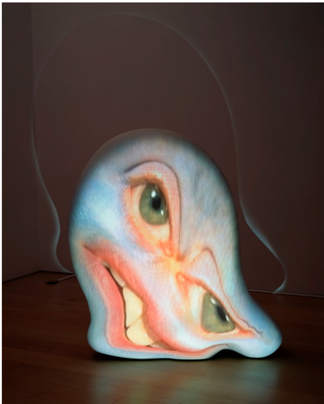
Thaw, 2003 fiberglass, video projection / H 119.5 x 114.5 cm – H 47 x 45 inches / Unique

All the images used for this press release are available upon request: Magali Deboth deboth@jmgalerie.com or presse@jmgalerie.com