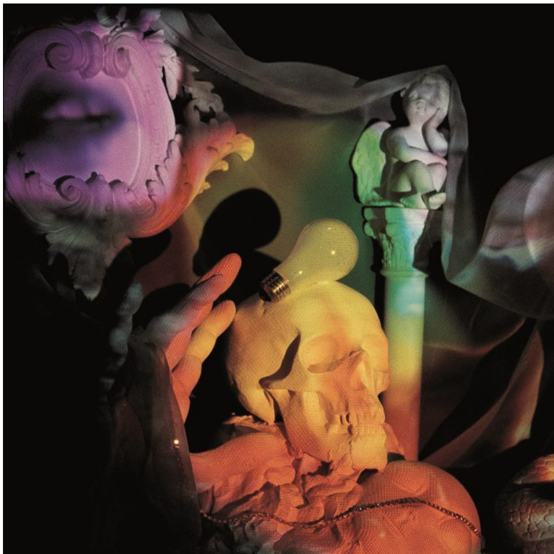
The Devil in the details, 1997 (detail)

Plaster, fiberglass, paint, plastic, projection system / H 158 x 53 x 70 cm - H 62 x 21 x 27 ½ inches / Unique