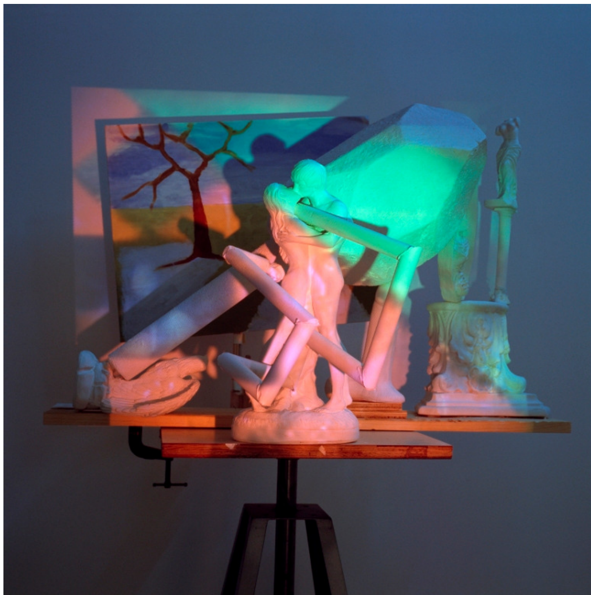
The angle, the tilt and the point of view: for Allendale South Carolina (virus), 1998 Plaster, wood, acrylic, video projection / H 153 x 86 x 80 cm - H 60 ¼ x 34 x 31 1/21 inches / Unique Photo: © Tony Oursler studio